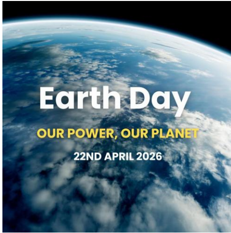
Earth Week, April 19–26, 2026