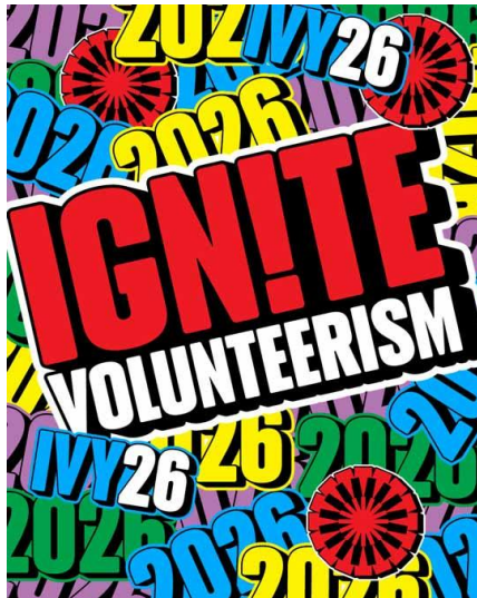
Volunteer Week, April 19–25, 2026